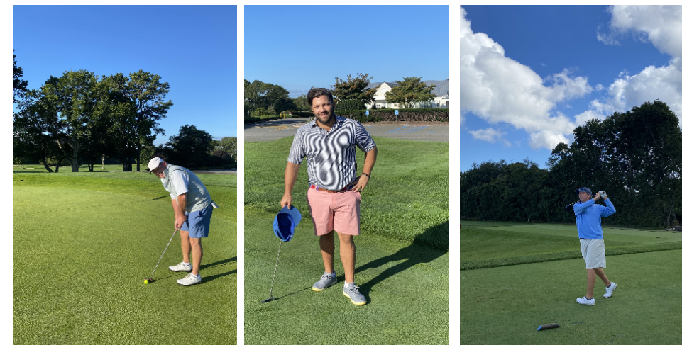
IMAGES FROM 2021: TAKE A LOOK AT THE BEST IMAGES FROM THE LICSF CLASSIC AT MEADOW BROOK AND THE LICSF GOLF MARATHON AT HUNTINGTON COUNTRY CLUB.